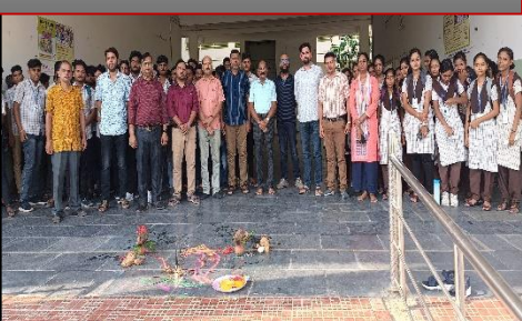
Diploma 2 nd Semester