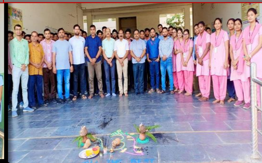
B.Tech 6th Semester