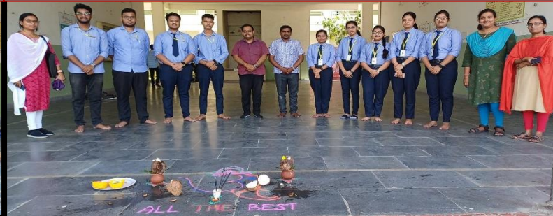
Int. M.Sc 8th Semester