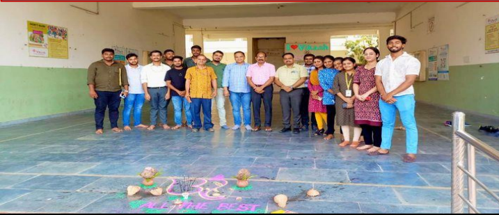
MBA 2 nd Semester