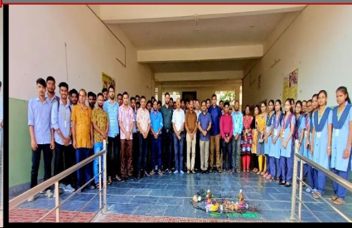
B.Tech 4th Semester