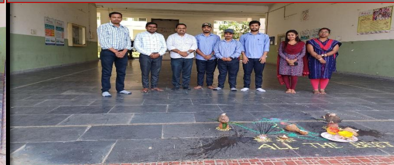
Int. M.Sc 6th Semester