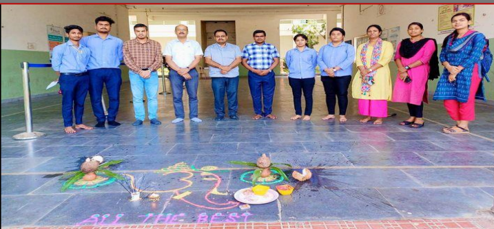
Int. M.Sc 4th Semester