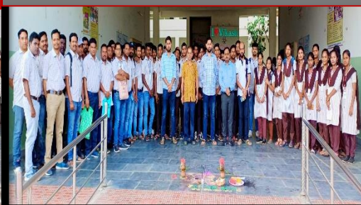
Diploma 4th Semester