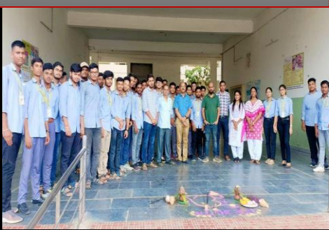
B.Tech 2 nd Semester