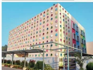
Vikash The Concept School, Sambalpur