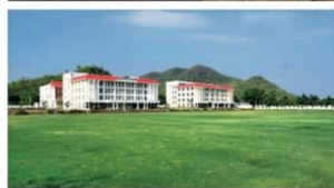
Vikash Residential School, Bhawanipatna

ensures high degree of performance in State and National level.