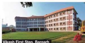
Vikash First Step, Bargarh

The receipt of Governor's Trophy and Chief Minister's Trophy by the students, is the authentication of its remarkable facilities and guidance in the field of dance, music, painting to explore their passions through extracurricular and co-curricular activities. It always encourages & provides means to its students to balance their pursuit for sporting passion through well developed infrastructure and training through professional coaches with out compromising on their academics which