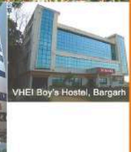
VHEI Boy's Hostel, Bargarh

Contact for queries: 94393 49333 | 92372 70045 | 82800 08111 | 99377 97954