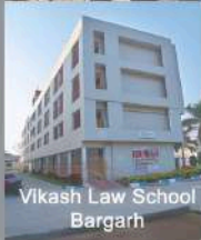
Vikash Law School, Bargarh