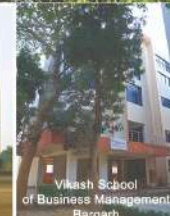
Vikash School of Business Management, Bargarh