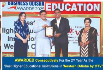
AWARDED Consecutively For the 2 nd Year As the "Best Higher Educational Institutions in Western Odisha by OTV".