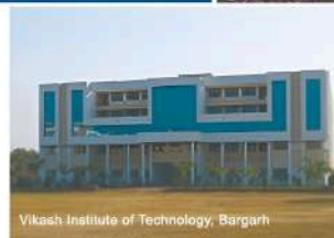
Vikash Institute of Technology, Bargarh