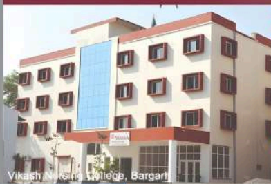
Vikash Nursing College, Bargarh