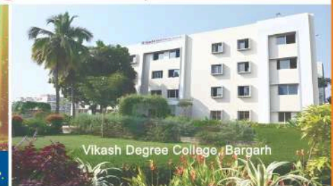
Vikash Degree College, Bargarh